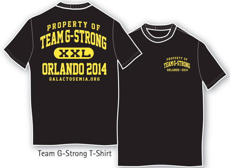
Team G-Strong T-Shirt