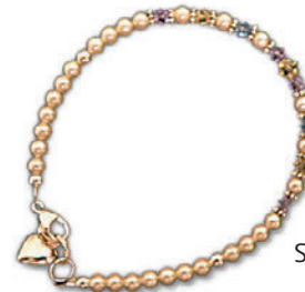
Swarovski Crystal Bracelet